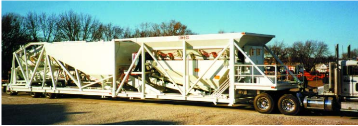
Mobile tow-away self-erecting batch plant.